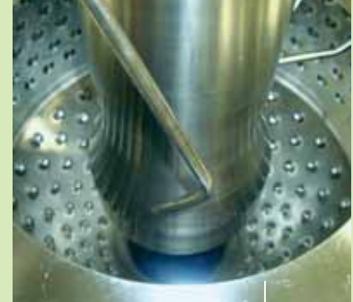
Anti-oxidant recovery system