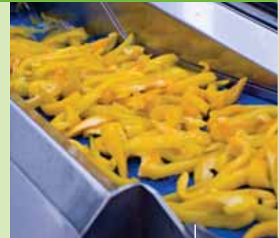
Continuous flow processing