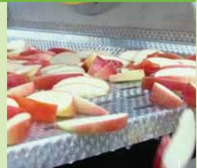
Sterile, stable and ready for packaging