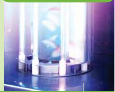
The UV 'Turbulator' in action

Patented Fresh Appeal Technology integrated into existing workflow