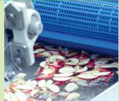
Temperature controlled immersion bath